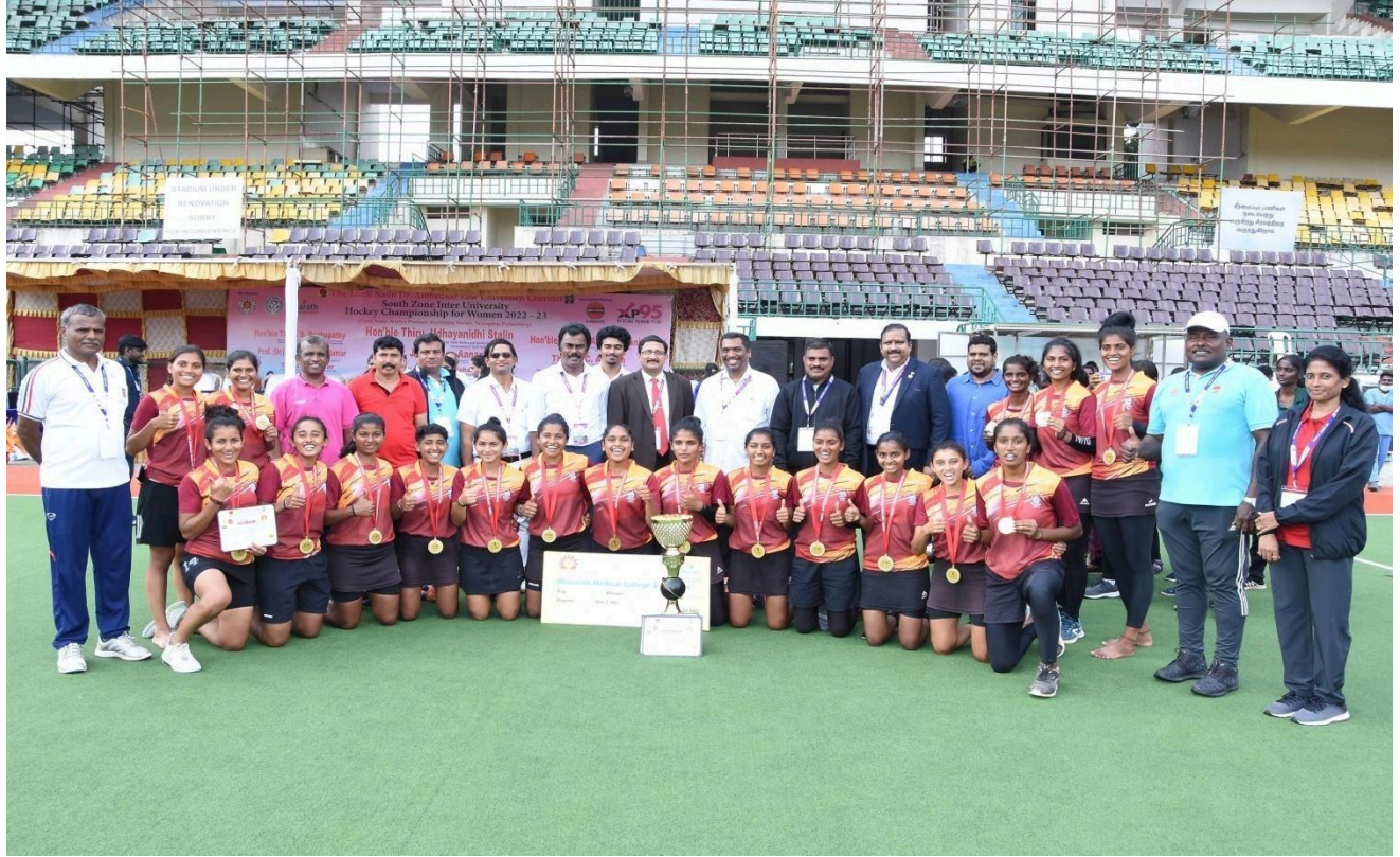
UNIVERSITY OF MYSORE WINNERS