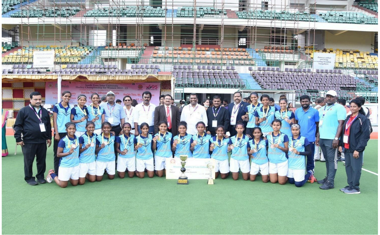
UNIVERSITY OF CALICUT THIRD PLACE